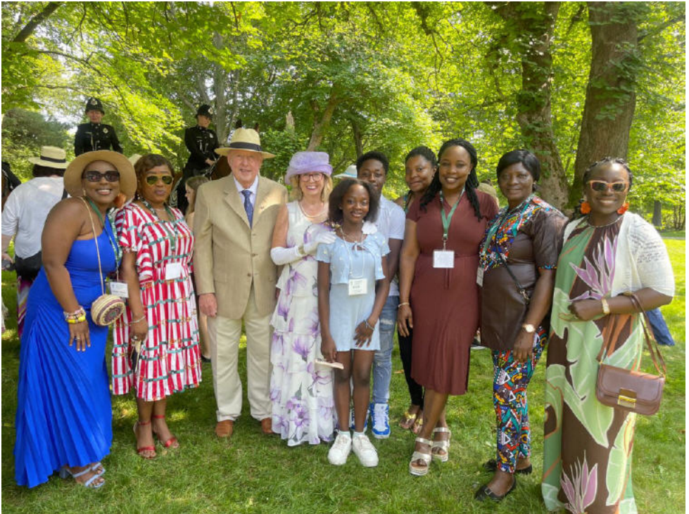
Lieutenant Governor of Newfoundland and Labrador with IFL members

IFL Cultural Days in Senegal Orphans in the Seychelles Mattresses for a school in Burundi Piglets in Malawi Homelessness in Newfoundland Support for Zambian school