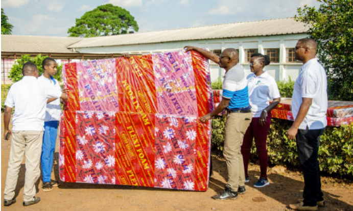
Delivering mattresses in Burundi

The International Committee has received 11 applications for the £500 Grant for Special Project, to date, with some other Groups planning a project in the near future. We encourage every Group to avail of this opportunity.