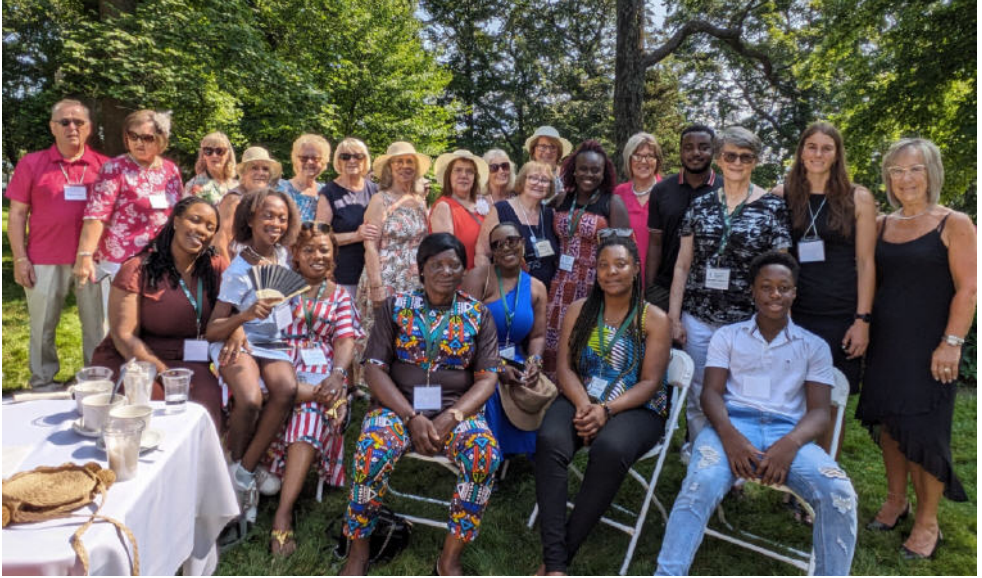
The IFL Groups at the Lieutenant Governor's Party

Her Honour The Honourable Joan Marie J. Aylward, O.N.L., Lieutenant Governor of Newfoundland and Labrador, represents His Majesty King Charles III in Newfoundland and Labrador. The Lieutenant Governor fulfills the roles and functions of the Crown, including granting Royal Assent to provincial laws.