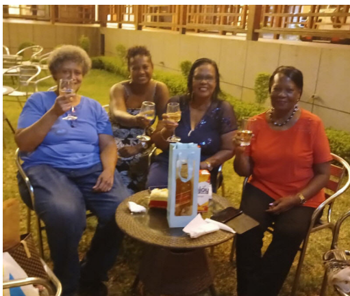
Celebrating a birthday