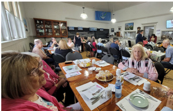
Members of IFL Avalon enjoying an afternoon of friendship

It was a beautiful afternoon of friendship and sharing. The event was made possible by the support received from the International Friendship League.