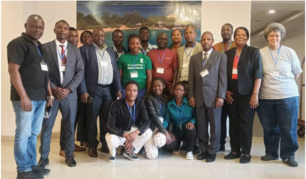
Delegates and members at the International Assembly 2024

IFL Holiday in Malawi Assisting orphans in Burundi IFL activity in the Seychelles Solidarity in Senegal Family Fun Day in Newfoundland Uganda tap water project