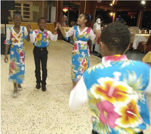
Young dancers at the Creole Night

Seychelles Creole Night - The IFL group joined in with the Seychelles nation to celebrate this important day in the Seychelles which is normally held on 31st October each year, to end the Creole Week. During this week the people learned more about its culture through local cuisine, Creole traditional dance normally called the KAMTOLE, a poetry competition where local poets showcase their talents, school children competing in Creole story and song writing and many more. Normally this is a colourful week with bright colours decorating our town and districts. It is also an attraction for our tourists.