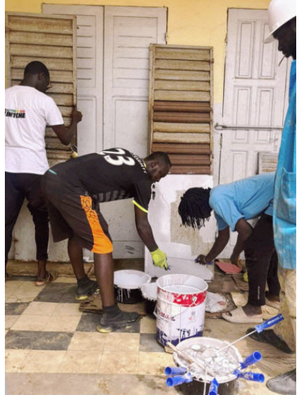
Here it is our members placed inside the rooms who do the same work as those outside in the schoolyard