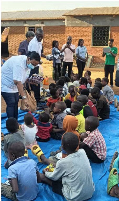
Distributing gifts at the orphanage

Organized by IC, a farewell dinner was hosted on Friday at the main restaurant of the hotel although most participants had departed then. However, those who were still in Malawi enjoyed a fruitful and friendly evening while sitting around a large table to say thank you and goodbye at the same time. We really cherished this moment that has kept fond memories of the laughs of happiness and friendly jokes cracked. A lot of photos were also taken as memories of Malawi.