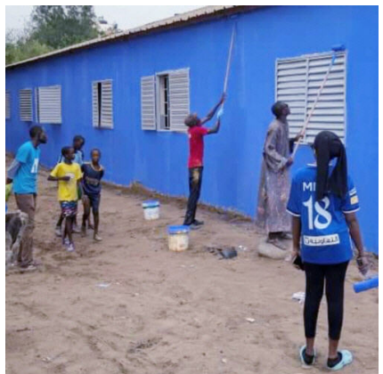
Our IFL members, both men and women, volunteered to put on the paint and the final finishing touches.