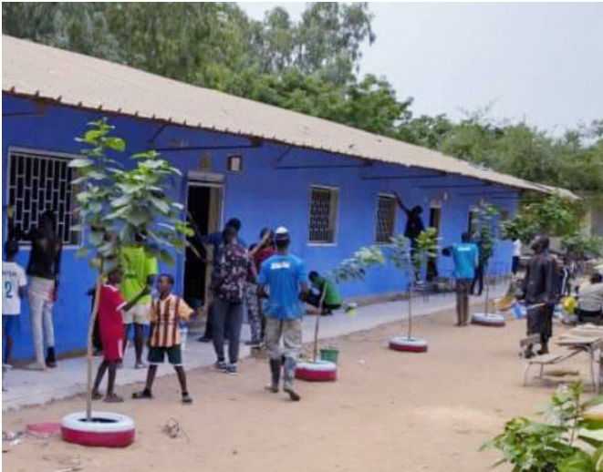
A clean smart school once again

Therefore, we members of the IFL Senegal group decided to find solutions to make school practicable.