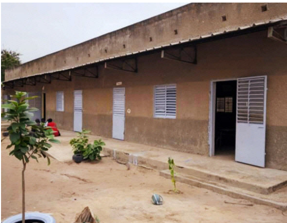
The water has been pumped out