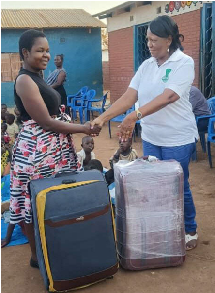
Suitcases with clothes